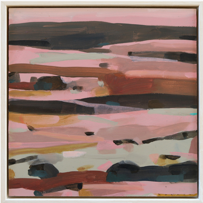
Bushfire Haze, 2024 Acrylic on board, 26x25cm framed Limed-timber shadow box frame $360