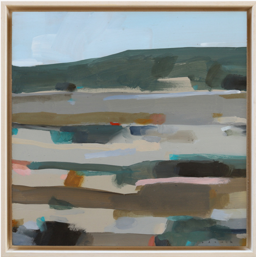
Flood Plain I, 2024

Acrylic on board, 30x30cm framed Limed-timber shadow box frame $390