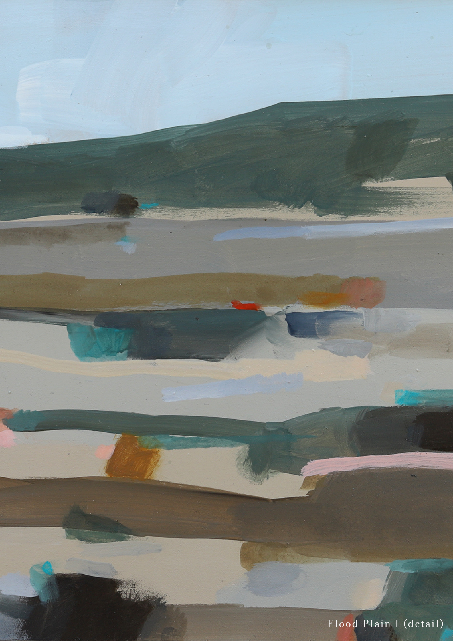
Flood Plain I (detail)