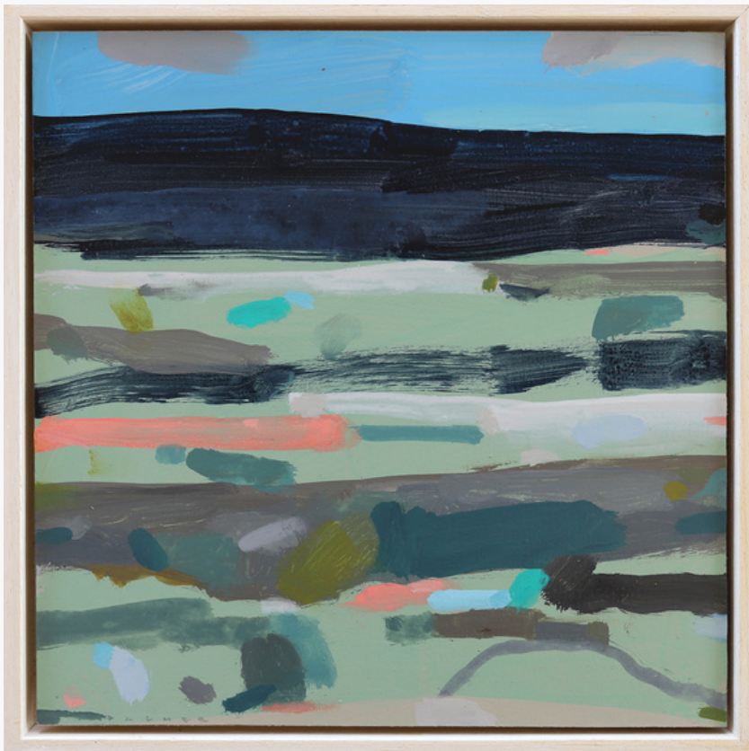
Alluvial Plain II, 2024 Acrylic on board, 26x25cm framed Limed-timber shadow box frame $360