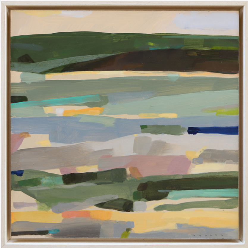
Flood Plain II, 2024

Acrylic on board, 30x30cm framed Limed-timber shadow box frame $390