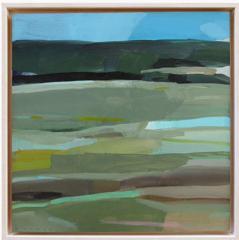
Western Slopes, 2024 Acrylic on board, 30x30cm framed Limed-timber shadow box frame $390