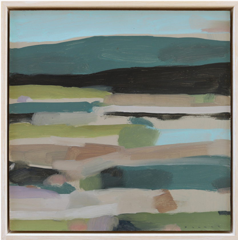
Alluvial Plain I, 2024 Acrylic on board, 26x25cm framed Limed-timber shadow box frame $360