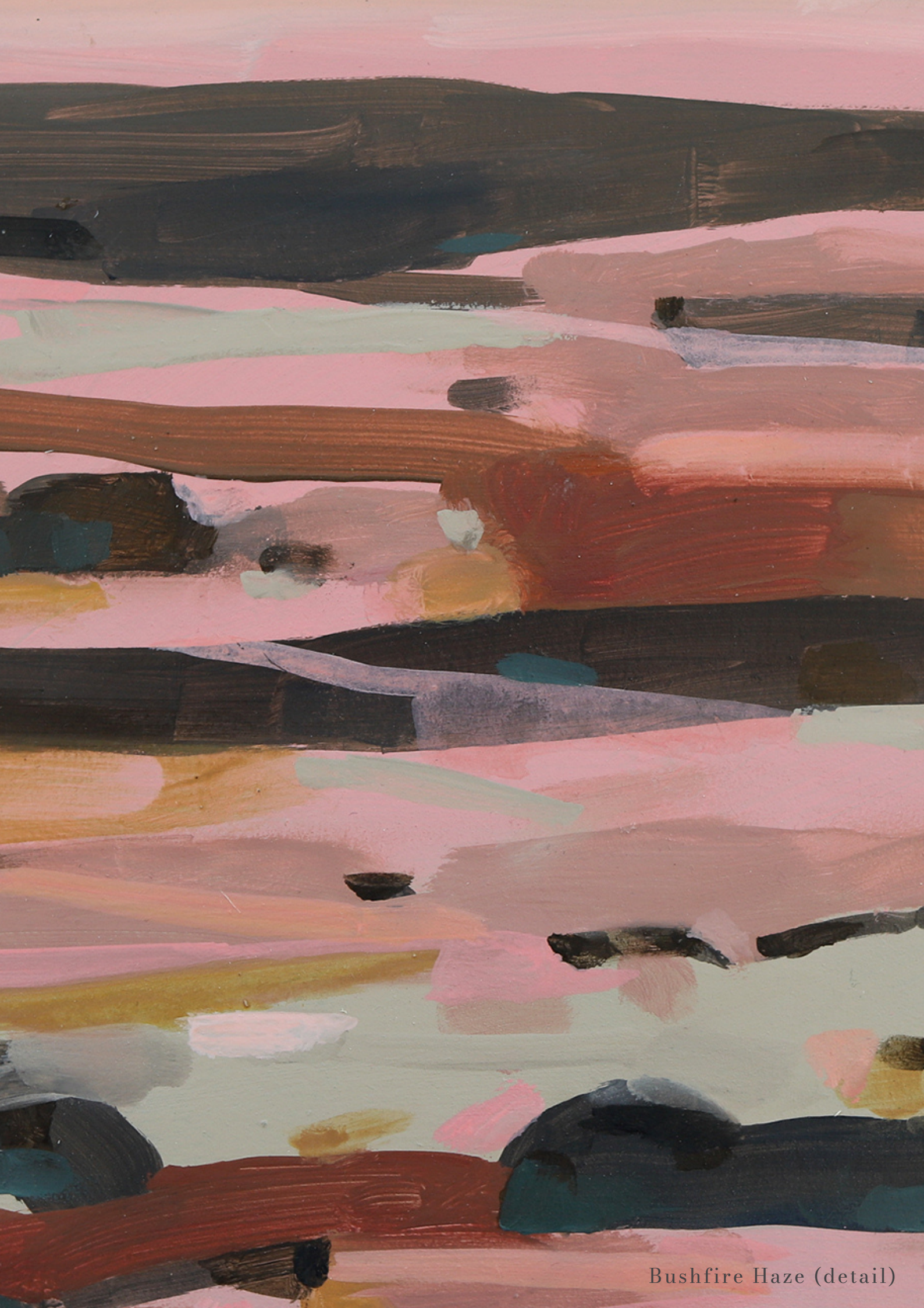
Bushfire Haze (detail)